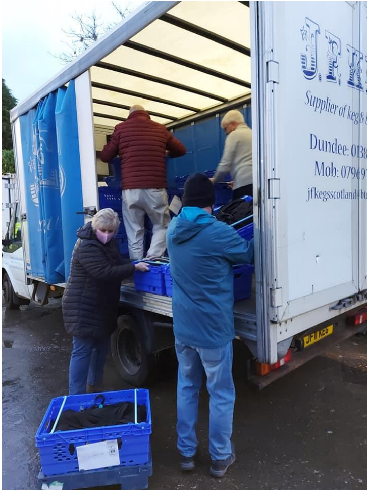
Volunteers receive clothing from Tesco and pack it onto the van for delivery to MSIP.

Michelin Scotland Innovation Park identified space within their complex where clothes could be stored and all COVID guidelines met. A bespoke referral form was sent to all schools and returned within the deadline of the end of November. The number of children identified had now reached 2926. The orders were collated within three weeks and the first orders went into suppliers very quickly thereafter.