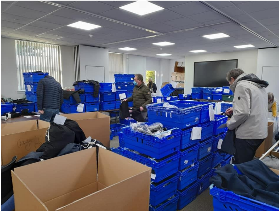
Cosy Bairns volunteers sorting and packing clothes

There were a few incomplete packs which were all dealt with through making direct orders from the suppliers. A small amount of excess items were initially stored at the Michelin site, but were later distributed between some primary and secondary schools for general use.