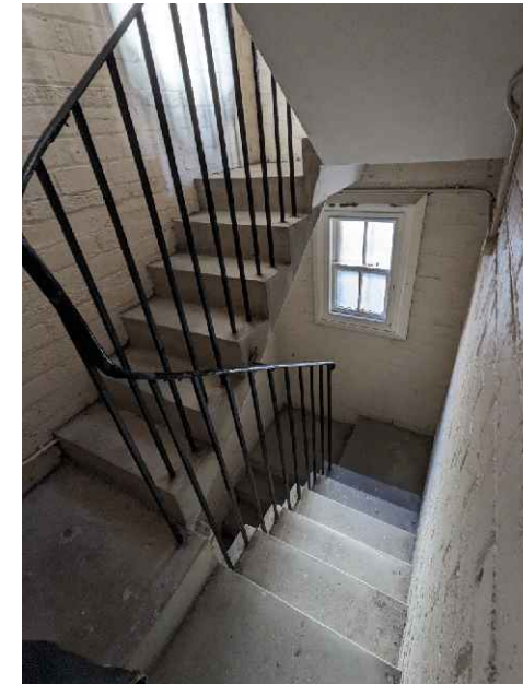
CONCRETE ESCAPE STAIR