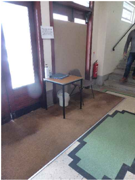
ENTRANCE / TERRAZZO