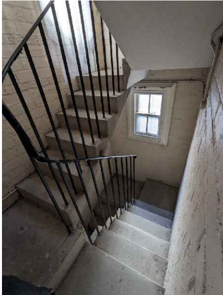
EXISTING CONCRETE STAIR TO BE REMOVED

NEW SHARED LOBBY REMOVE EXISTING DOOR REHANG EXISTING DOOR OTHER SIDE