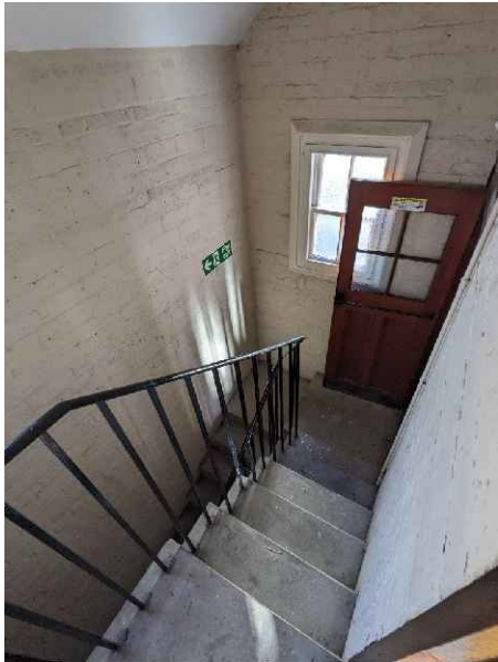
EXISTING CONCRETE STAIR TO BE REMOVED