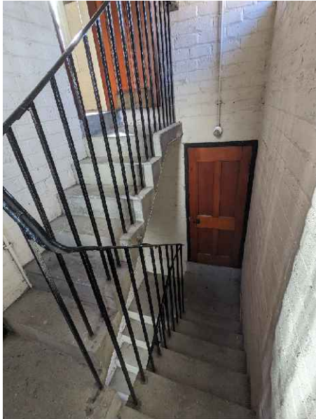
EXISTING CONCRETE STAIR TO BE REMOVED